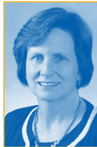
New members of the Board of Directors, from left to right: