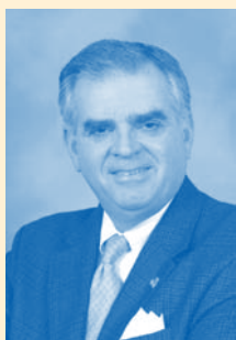
US DOT Secretary Ray LaHood