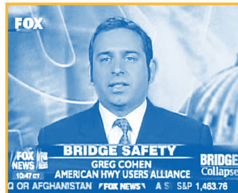
On national television, Cohen spoke about the realities of aging infrastructure and urged motorists to visit www.highways.org to look up bridge inspection data.