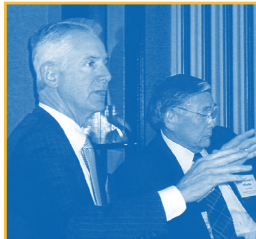
Highway Users Chairman and ATA President & CEO Gov. Bill Graves presided over the 2007 Annual Meeting with Honorary Highway Users Chairman Secretary Norm Mineta.