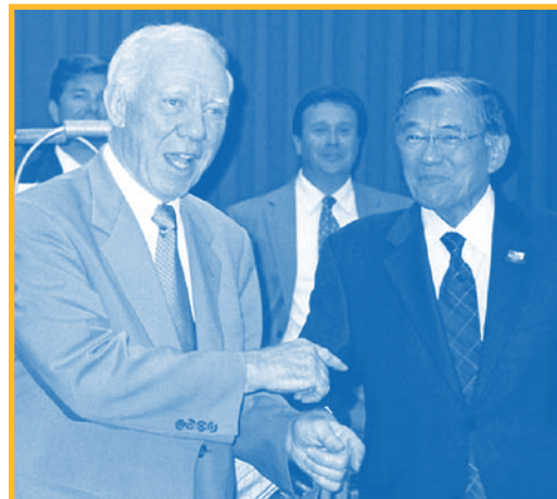
House T&I Chairman Jim Oberstar (D-MN) addresses the crowd at The Highway Users' Congressional Reception and enjoys a laugh with Secretary Norm Mineta.