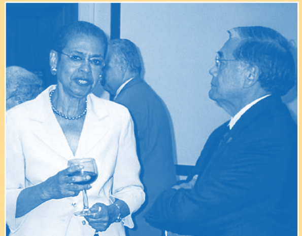
DC Delegate Eleanor Holmes Norton was one of 16 Members of Congress who attended the Congressional Reception. Norton chatted with Secretary Norm Mineta.