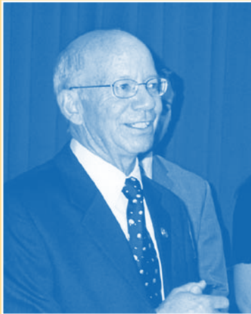
Highways & Transit Subcommittee Chairman Peter DeFazio (D-OR) spoke to attendees at The Highway Users' 75th Anniversary Congressional Reception on Capitol Hill.